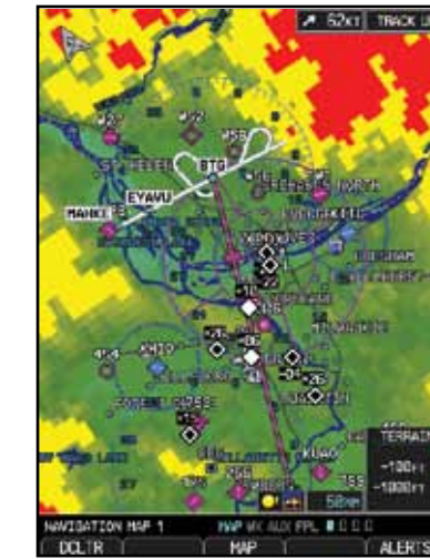
Integration of traffic, terrain and obstacle alerting on a Garmin moving-map display gives pilots a comprehensive picture of potential flight path conflicts.