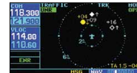
GTS 800 series traffic alerts can be displayed on Garmin’s popular 400W and 500W series navigators.