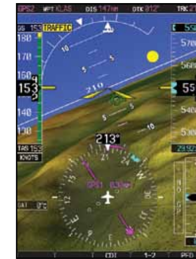
With Garmin’s SVT-capable flight displays (sold separately), traffic can be depicted in a 3-D format. As targets get closer, the symbols get larger.