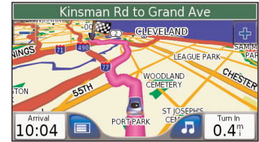
Big 4.3-inch color touch screen displays map detail in 3D or bird's-eye perspective