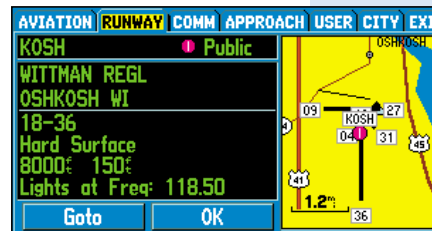
A wealth of airport information