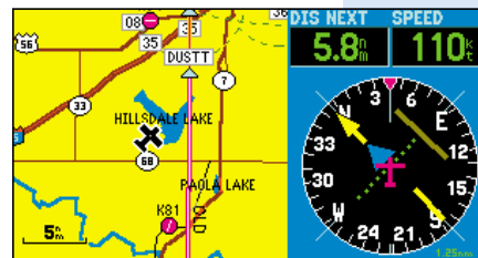
"vector to final" on HSI, moving map split screen