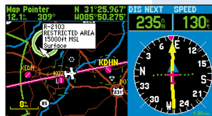
SUA data revealed on map page (screen shown in night mode)