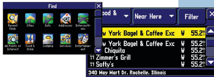
Screen shown with MapSource City Navigator data