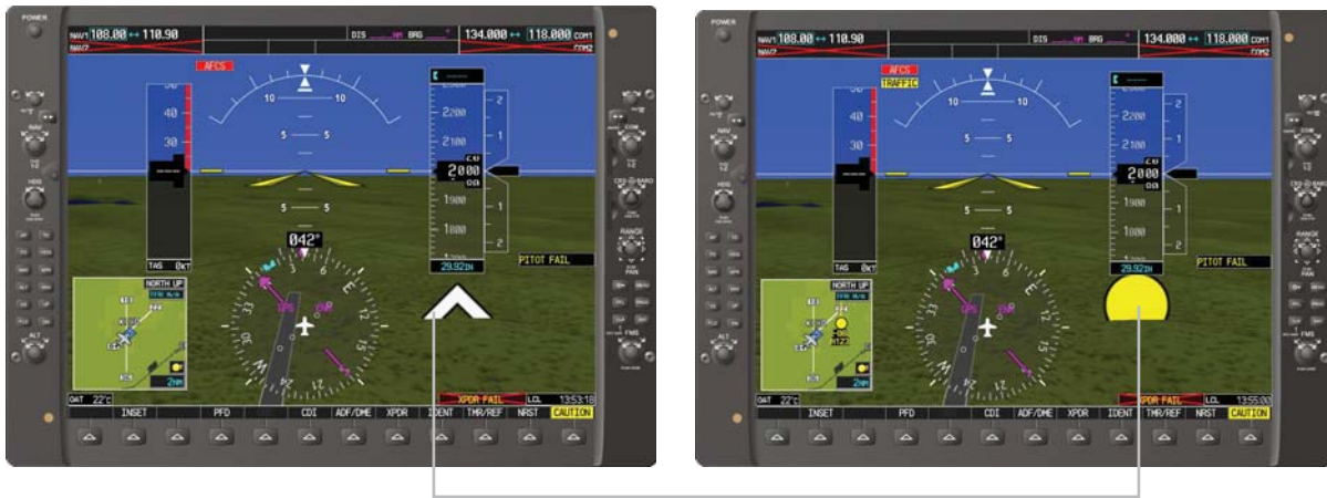
Cropped Traffic Symbols