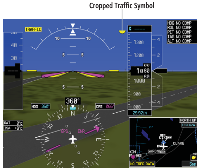
Figure 4 – Traffic Symbol Cropped by Persistent Sky Band

Other points to consider regarding the appearance of Traffic symbols: